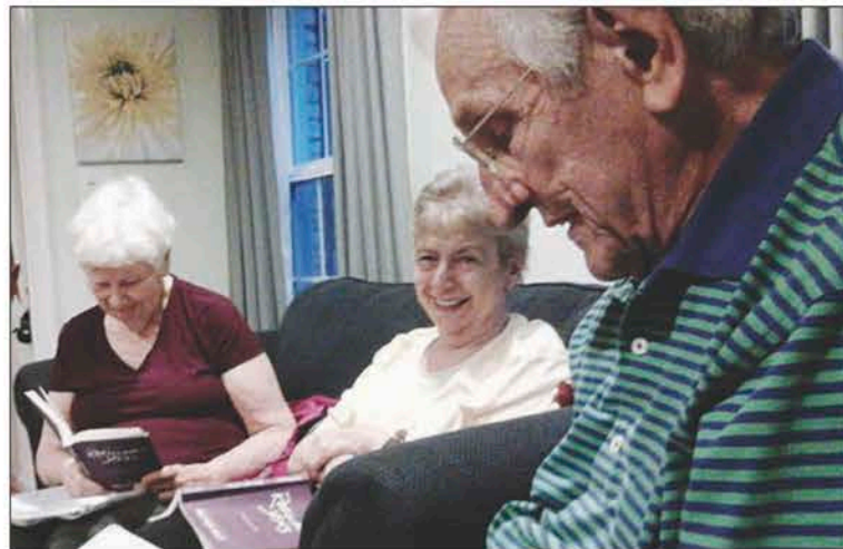
Enjoying the moment in a home-based St Raphael Small Group

Over the summer, St. Raphael's ran a pilot program with three small