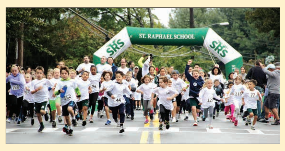
St. Raphael School's Angels on the Run promotes fitness, friendship, and fun.