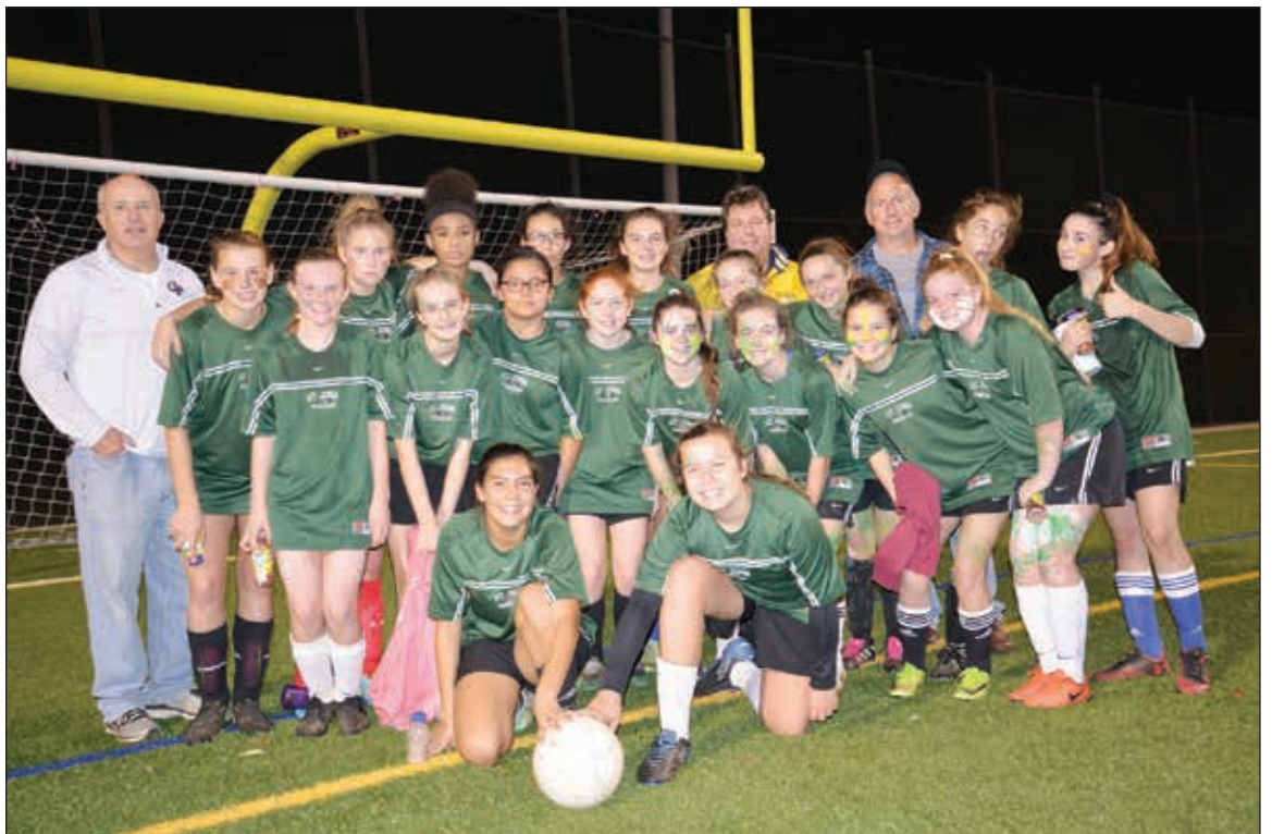
Congratulations to the coaches and players of our 14U Girls Soccer team for taking 2nd place in the City Title tournament.