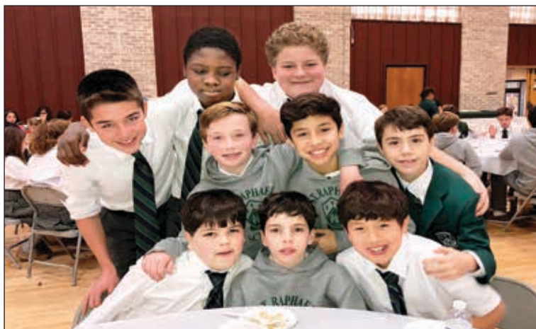
At the SRS Thanksgiving Feast, students give thanks for their many blessings – including friendship.

A lmost 400 St. Raphael Angels were up and running at the sixth annual Angels on the Run Oct. 21, competing in a 5K race, a 1-mile run, and a cherub dash for kindergartners and preschoolers. School and parish families and friends came out to raise funds for SRS and be a part of the school tradition and community fun. Made possible by the many volunteers, sponsors, runners, and those who came out to cheer, this event was a winner from start to finish.