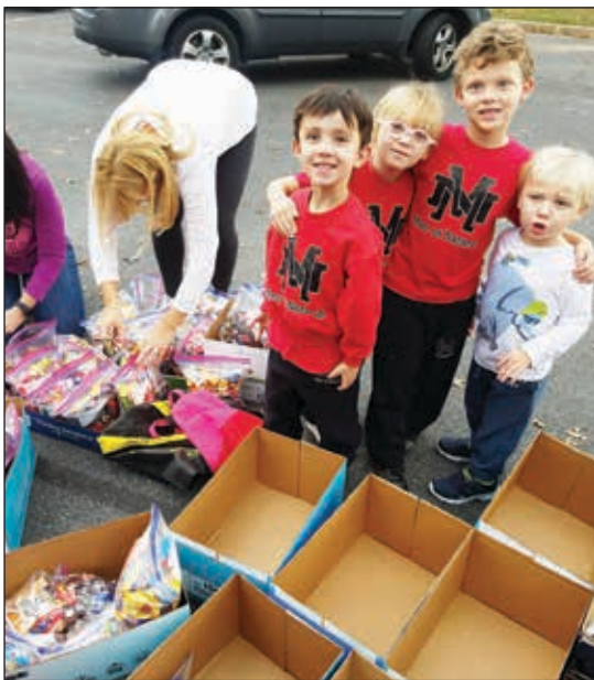
First grade students and parents collected enough leftover Halloween candy for 69 service members who are deployed.

Mary of Nazareth's first grade class contributed to school service efforts with their "Candy for